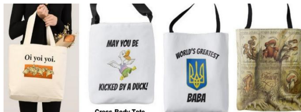
Cross-Body Tote Ukrainian on reverse!